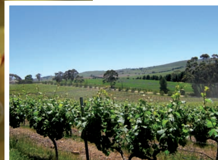
The latest release rieslings from the Clare Valley are pretty and floral - perfect for spring.